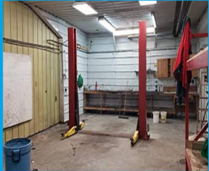
Hoist included in North portion of building