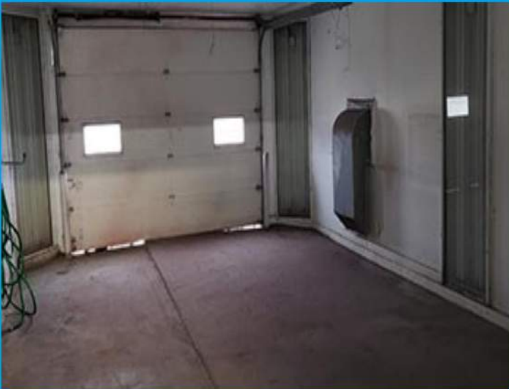
Area can be used for a paint booth, separate side door