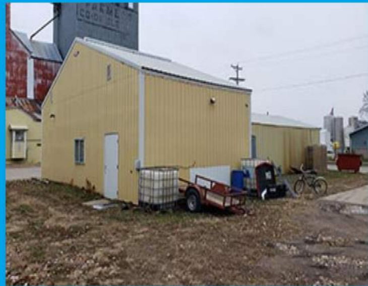
View from rear