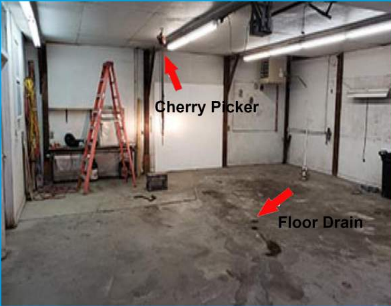
Main Shop Area