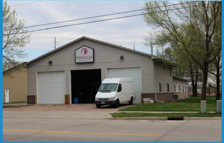
12" Overhead Doors