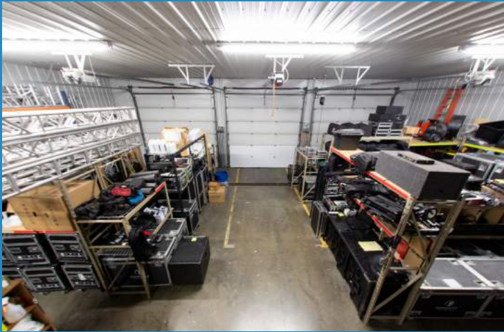
14" Foot Ceilings