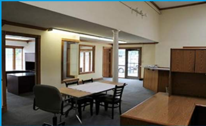
Open work area/view of 2 Offices