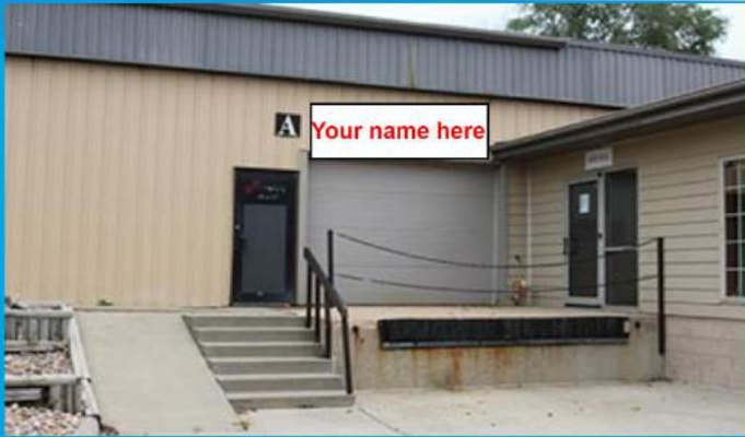
Front entrance to offices