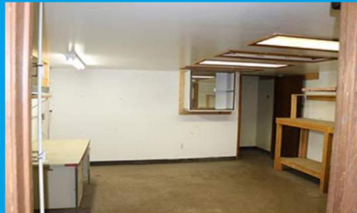
Warehouse Office/Mezzanine with storage