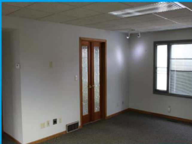
French Door to Office