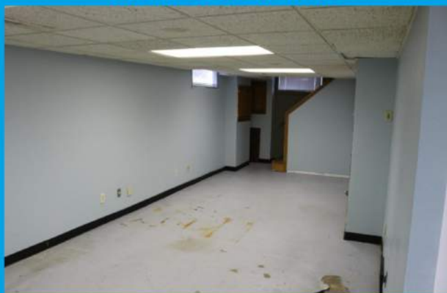
Open dry storage/work area in lower level