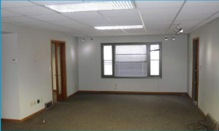
Wide Open work area looking North