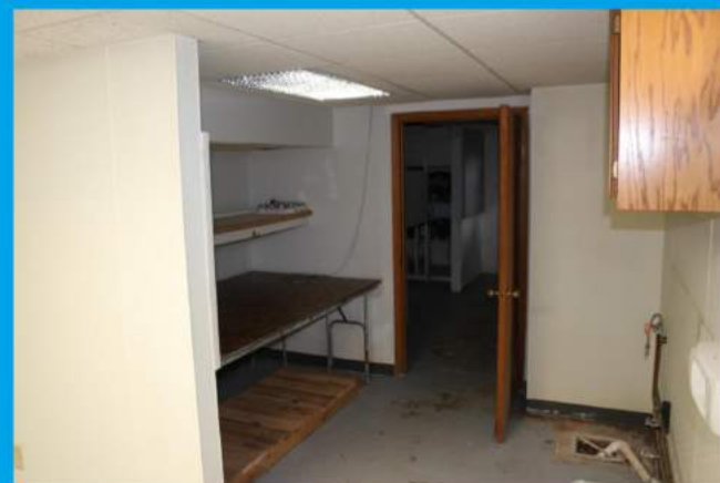
Additional lower level storage