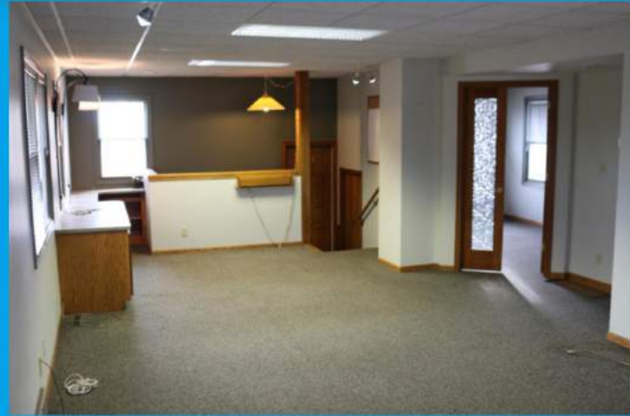
Work area looking South