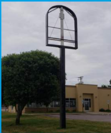
Sign on Cliff Avenue