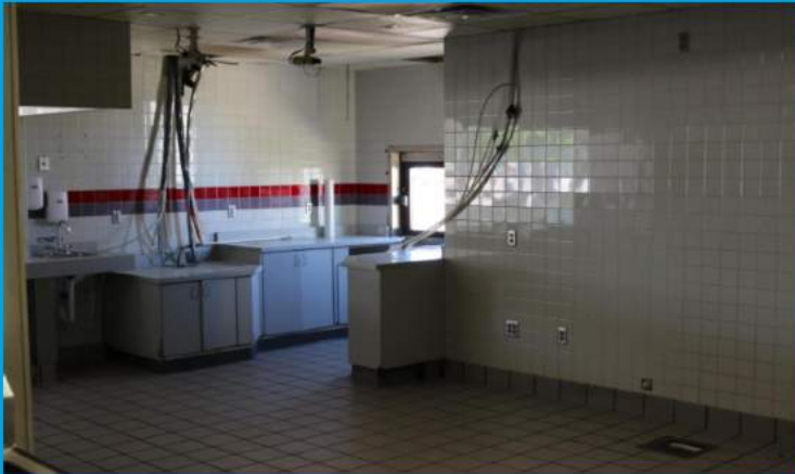
Drive-Thru window/Kitchen Area