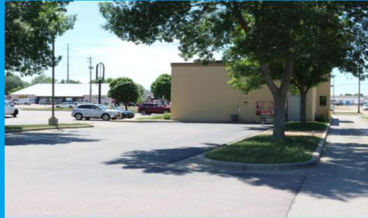
Drive-Thru Lane/Parking Lot