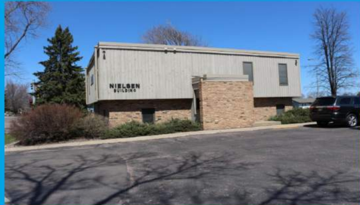
View of Building from parking lot