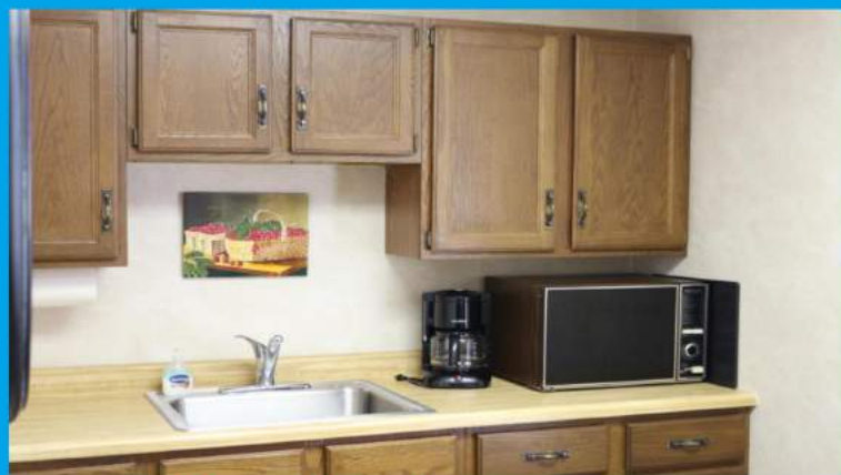
Shared breakroom Area