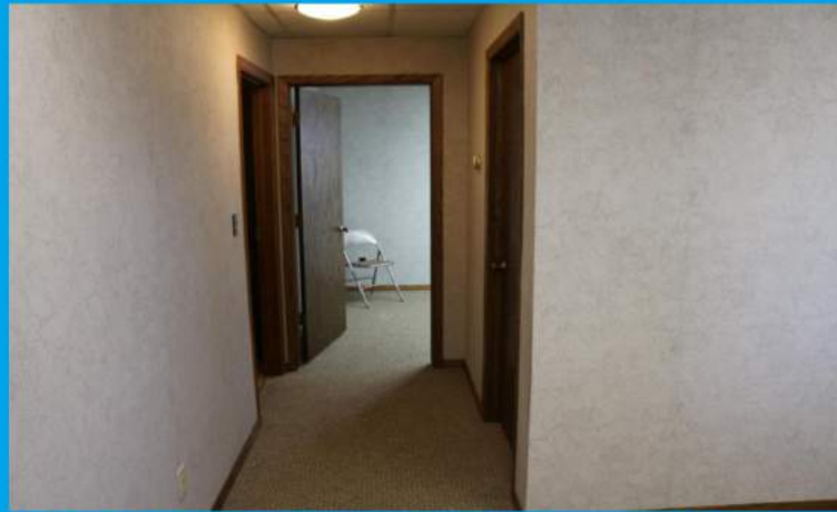
Small hallway that connects the two offices