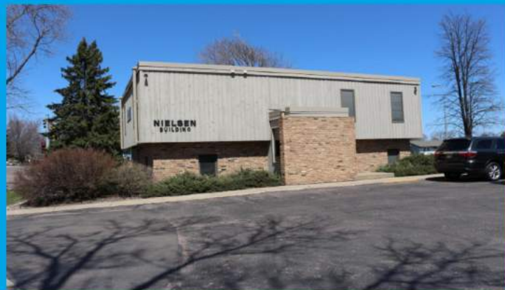
View of Building from parking lot