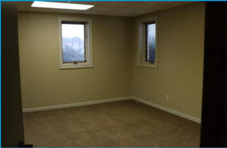
Open work/reception area