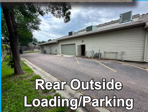
Rear Outside Loading/Parking