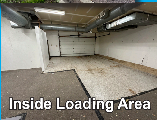
Inside Loading Area